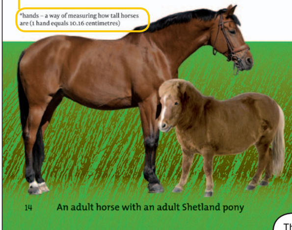
14 An adult horse with an adult Shetland pony

*hands – a way of measuring how tall horses are (1 hand equals 10.16 centimetres)