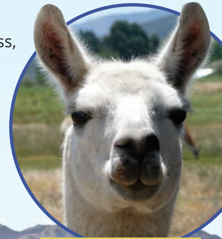
A llama's split lip

Like a lot of animals, llamas eat grass, but they eat many other plants as well. Llamas have a split lip, which makes eating thorns easy. They can also walk a long way without having to drink much water.