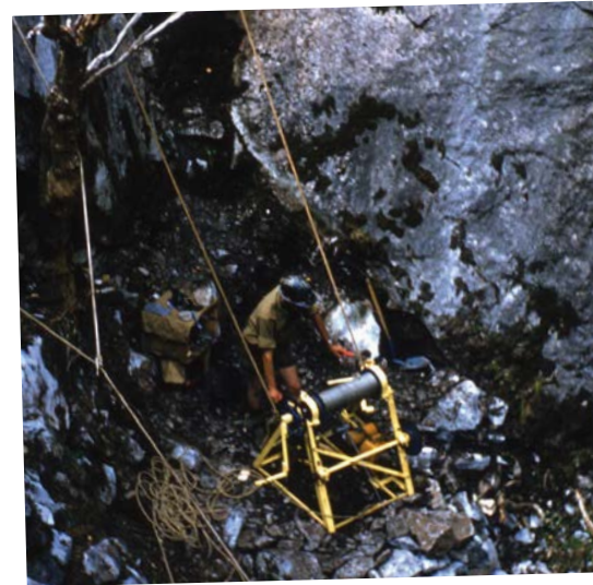
The winch ▲

The best option was to use a winch . Each caver was tied to a wire cable and lowered slowly into the hole. It took an hour and a half for the first person to reach the bottom. When they got down there, they saw a world nobody had ever seen before.