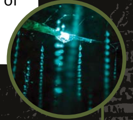
Inside glow-worms (titiwai)