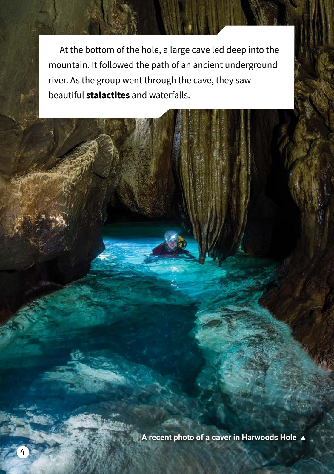
A recent photo of a caver in Harwoods Hole ▲

At the bottom of the hole, a large cave led deep into the mountain. It followed the path of an ancient underground river. As the group went through the cave, they saw beautiful stalactites and waterfalls.