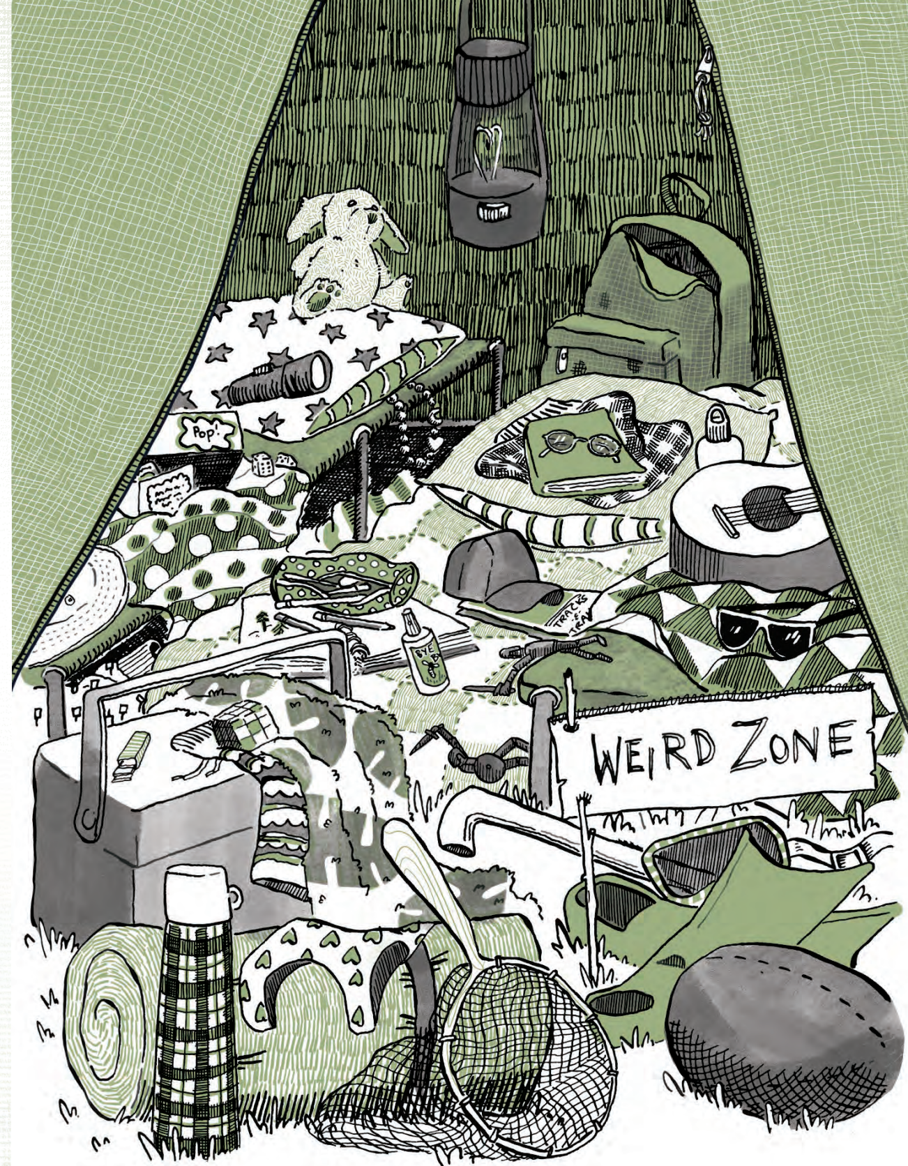
illustrations by Kirsten Slade

“Got it,” Dad says. “Some traditions shouldn’t change, right?”