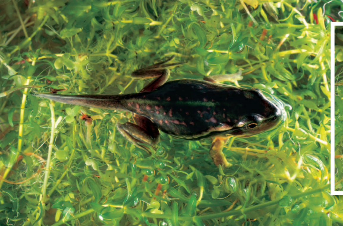
and his tail got smaller