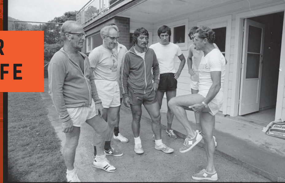
Lydiard (far right) gives training tips.

Lydiard was also interested in the idea of “mass fitness”. He believed that distance running was good for everyone. In 1962, he helped set up the Auckland Joggers Club, which attracted a lot of people with heart problems. Lydiard encouraged them to “run for their lives” – a concept no one had ever heard of. He claimed it was more satisfying to see club members “running around and enjoying life within a year” than it was helping an athlete get to the Olympics.